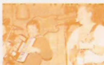
Bogside Zukes Trio