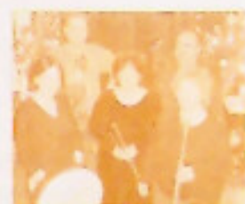
Barley House Band

11:15 am Unity Mass 12:30 pm Mullane Irish Dance Academy 1:15 pm Red Hair & Freckles Contest 2:15 pm Mullane Irish Dance Academy with Bogside Zukes 3:00 pm St. Ambrose Irish Studies 3:35 pm Mullane Irish Dance Academy 4:10 pm Kids Parade